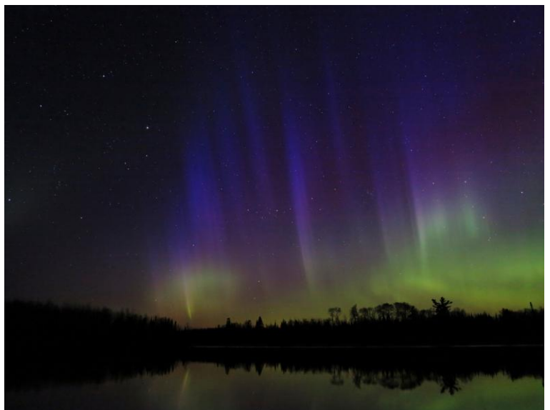
Now you know why we live here!