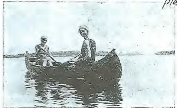
Splendid for all forms of boating.

You well know the universal question when the family is all ready for a drive is, "Where shall we go?" Well, an attractive cabin site on one of these lakes effectively supplies the answer because it provides an ideal "place to go." The first place to go should, therefore, be out to see these beautiful tracts.