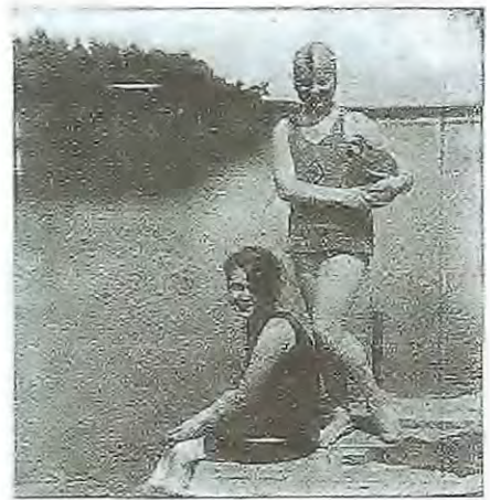
Come on in—the water's fine—nice and warm, white hard sand and gradual depth.

Chief among the desirable restrictions on this property are: No tarpaper shacks or other unsightly buildings will be permitted, nor will undesirable persons be allowed to purchase any of these cabin sites, for we control practically all the available land on the south side of these two lakes, and we wish to have it get into desirable hands. You will, therefore, appreciate our solicitude in keeping this property clean and strictly first class in every respect.