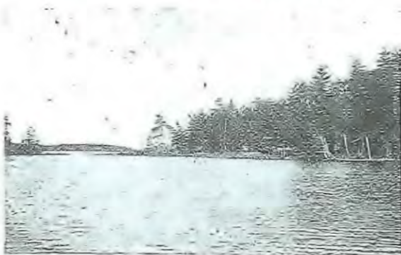
A bit of beautiful Shore Line.