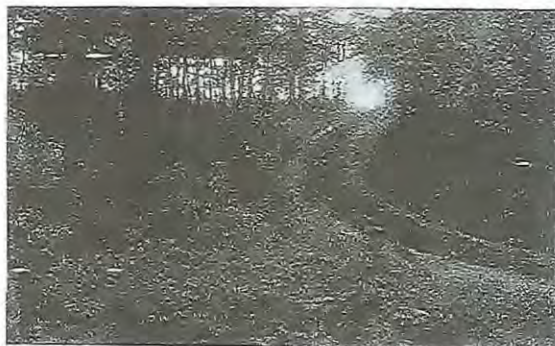
Nicely wooded with no high banks.

Raspberries grow almost like weeds. Blueberries are plentiful, and wild cranberries are also found in certain sections of the back country; in fact, many cabin residents put up much fruit during their summer stay. Fine gardens can be developed. Sweet corn and tomatoes mature considerably earlier than in the city due to the warmer temperature.